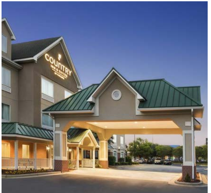
Country Inn & Suites by Radisson, Albany, GA 2809 Nottingham Way, Albany, GA 31707 Phone (229) 317-7100