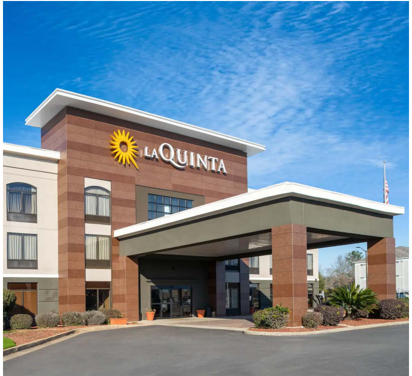
La Quinta Inn & Suites by Wyndham-Albany GA 2735 Dawson Rd, Albany, GA 31707 Phone: (229) 883-9800